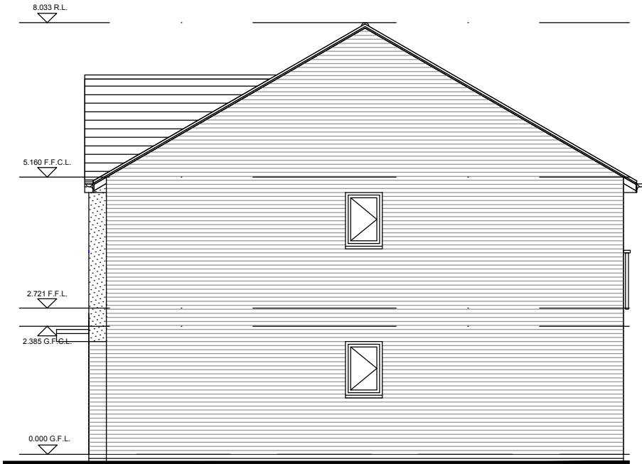
SIDE 1 ELEVATION